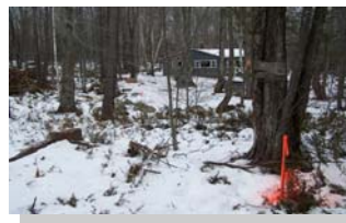
Rural Property Line Stakeout

By choosing Colonial Survey as your surveyor, your survey information will be on file in our office. We can utilize this information and build on this work to serve any future surveying needs.