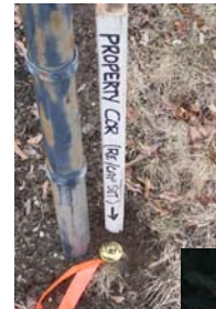
Sample Property Corner Marker