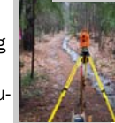
Robotic Total Station