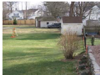
Urban Property Line Stakeout

Note: No plans are prepared for or recorded in the registry of deeds