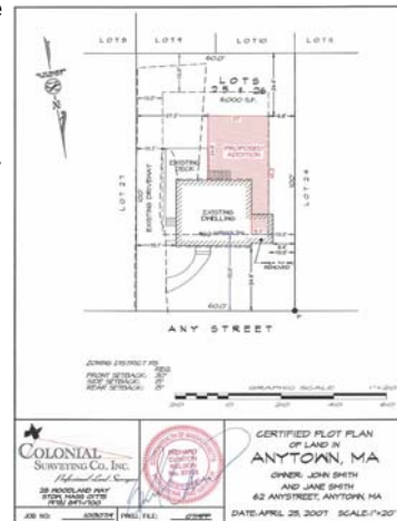
Sample Certified Plot Plan

We produce "CPP's" with CADD software which allows us to exchange information electronically with your Architect. Once the plans is completed we provide a full set of plans for you to file with the town to obtain you building permit.